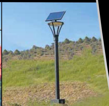
Flash & Flashy